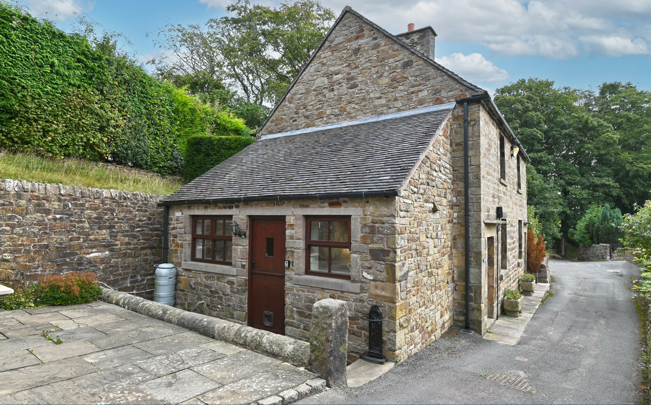
Rosannah Cottage Lane Head, Longnor, Derbyshire, SK17 0PD